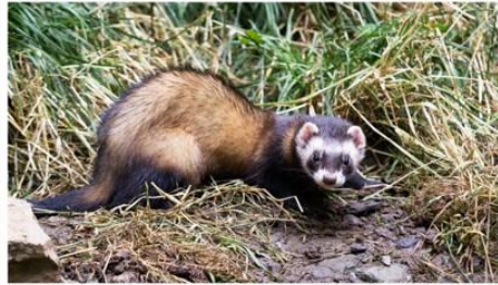
Ferrets, Australia's largest mustelid, are introduced predators that harm our native wildlife.

With their black eye mask, ferrets might remind you of the Hamburglar. But instead of targeting hamburgers, they are adept hunters with a wide range of native birds and lizards on their menu. They are the least researched introduced predator, so what do we actually know about them?