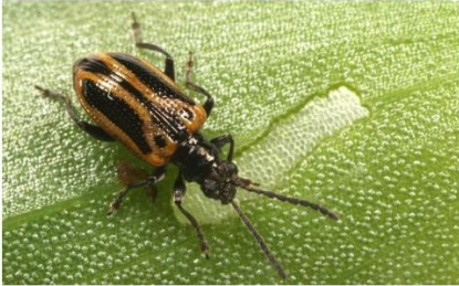
adult tradescantia tip beetle (Neolema abbreviata)