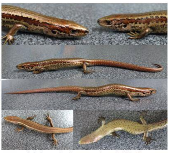
Figure 2: Skink features (as shown on a Chesterfield skink) Image: DOC