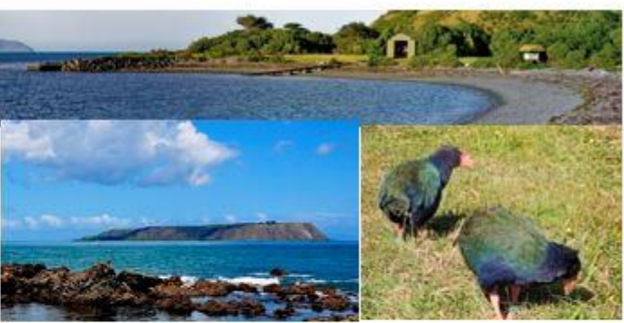
Mana Island - 41.0876°S 174.7815°E