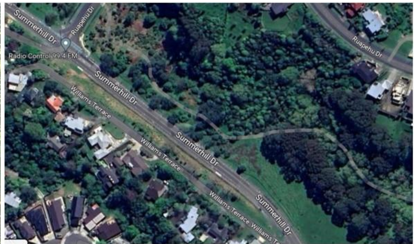
Access to Poutoa Walkway from Summerhill Drive