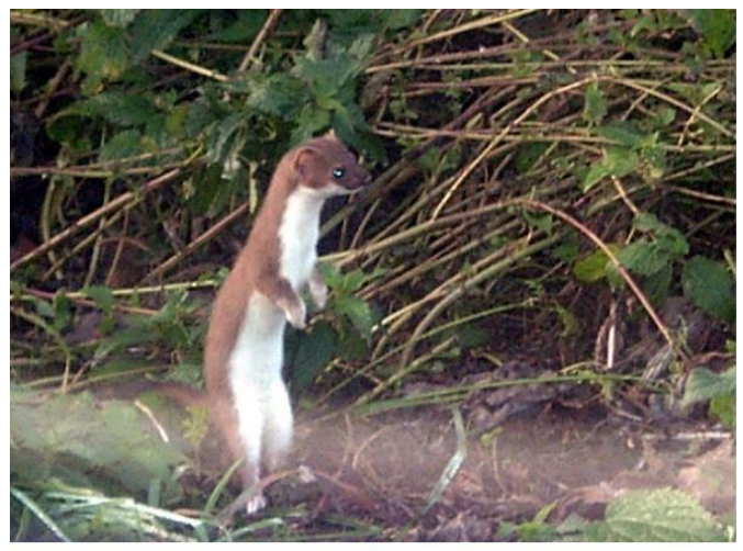
Weasels were detected in surprisingly high numbers after a beech mast in 2014.

An unusual outbreak of weasels meant DOC researchers in Nelson had the chance to find out about this rare mustelid predator.