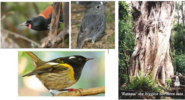
Saddleback, N.I. Robin & Hihi

It is some time since we visited Bushy Park Sanctuary and many changes and improvements have been made. We will have a guided tour around the Sanctuary and then you will have free time to explore on your own and get to know the Hihi (stitchbird) and other birds in Sanctuary.