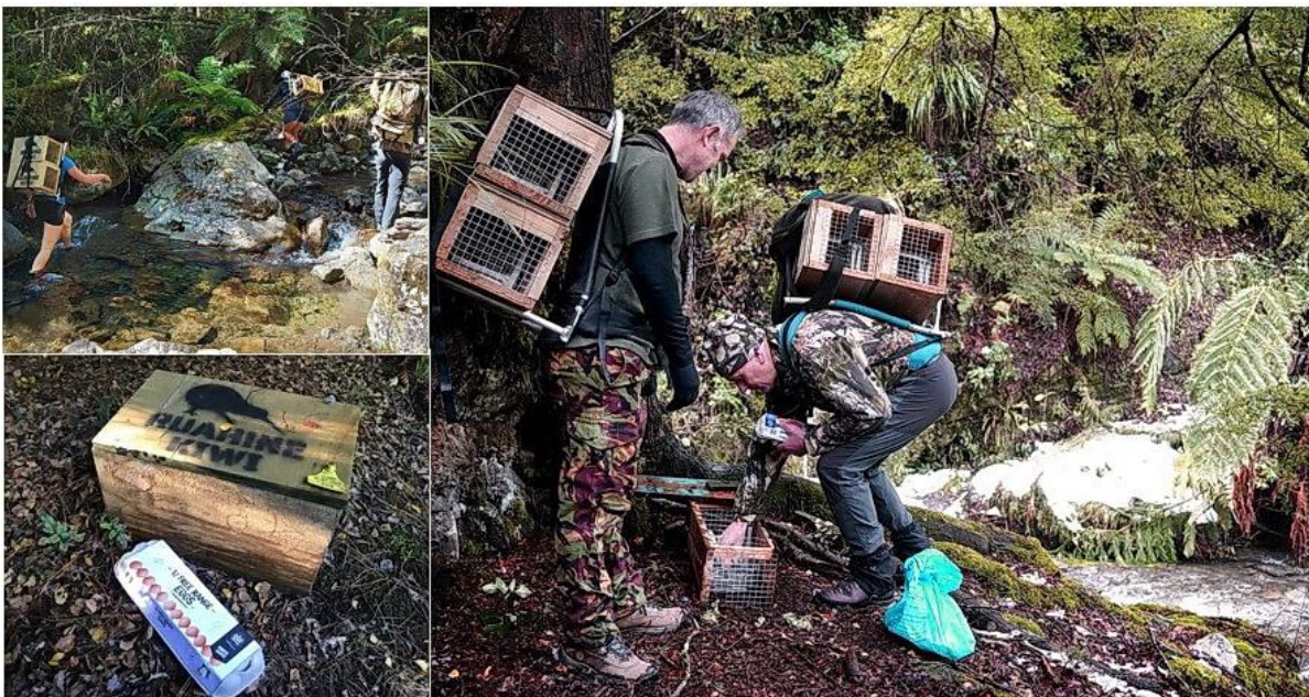
Trapping in the Southern Ruahines