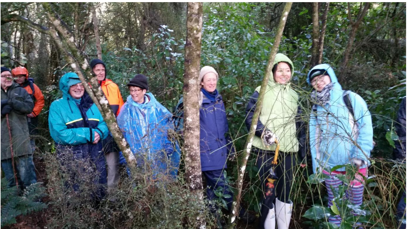
Experiencing the climate hypothesis at Paengaroa