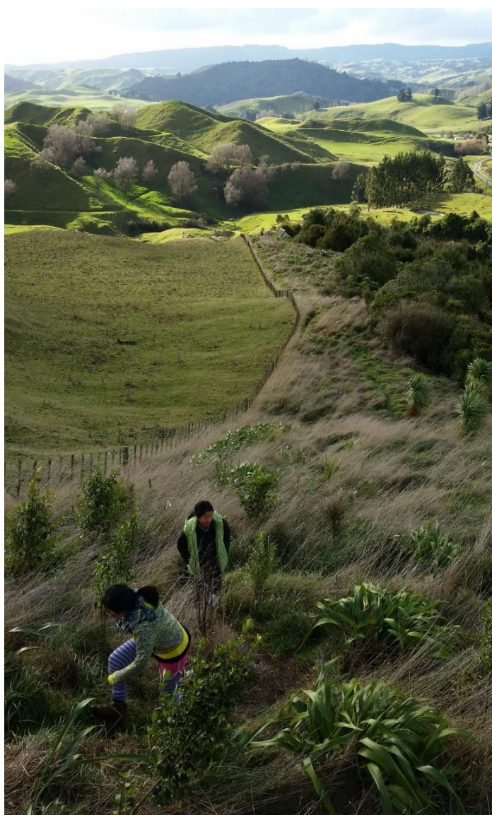
Looking over the Mataroa Valley to Paengaroa

Thank you to everyone who came - we all contributed to making this a great day out, with stories shared and new friends made. And we didn't even get to throw a gumboot...next time!